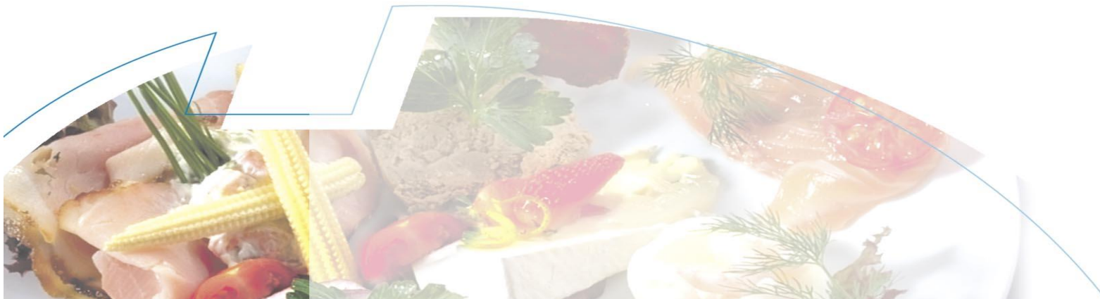
FUNCTION MENU 2009

This is only an example of ISS's capabilities and we are happy to discuss all your catering facilities which may include anything from a formal sit down meal to afternoon tea and all this with your added benefit of being produced right here at your Site.